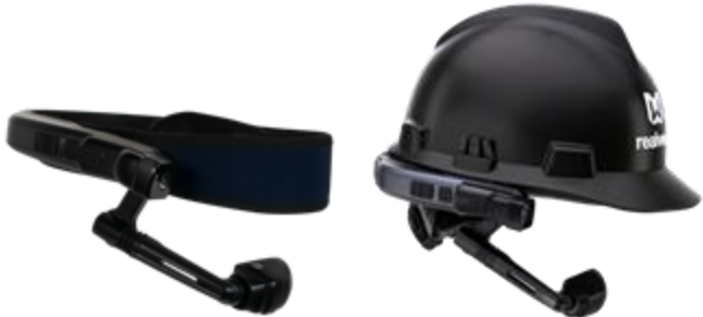
RealWear Navigator 500 series