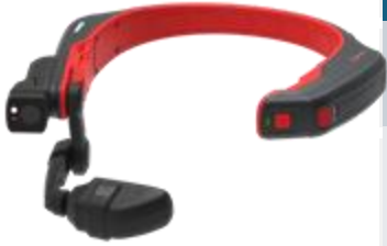
RealWear Navigator Z1